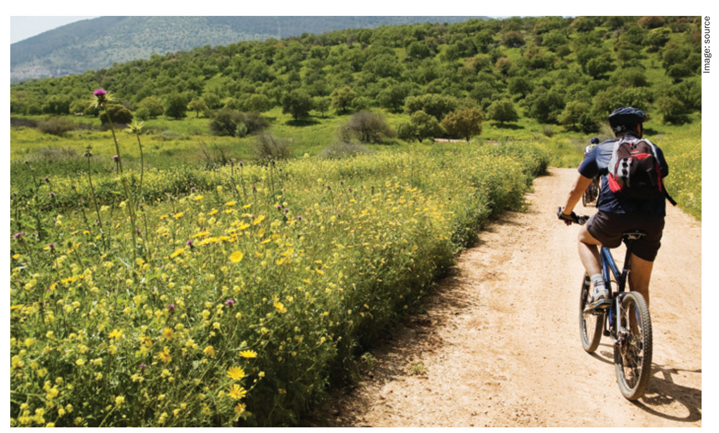
Thousands of scenic roads, observation points, hiking and biking trails and natural parks have been developed

400 mm and the mean annual temperature is 20-23° C. Isolated pistachio ( Pistacia atlantica ) and Christ's thorn ( Zizyphus spina-christi ) are native to this region. The Saharo-Sindic region extends in the south up to the Red Sea, and includes the southern part of the Jordan Rift. The average annual rainfall varies in this region from 25mm to 150 mm and the mean annual temperature is 25° C. Tamarisks grow sporadically or in groups in the sandy and partly salty soil and Acacia in oases and wadis.