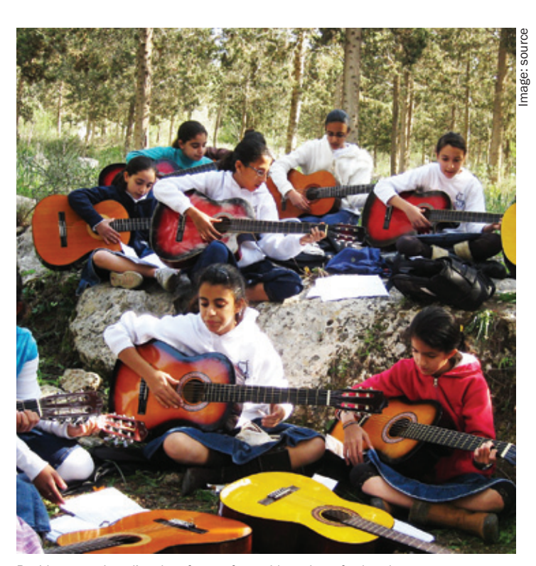
Residents use Israel's urban forests for a wide variety of cultural and recreational activities

After the first pioneering stage of afforestation in Israel, which was initiated at the beginning of the 20th century, the Israeli Forest Service, Keren Kayemeth LeIsrael (KKL), launched a policy that encouraged the adoption of sustainable forest management practices for planted forests.