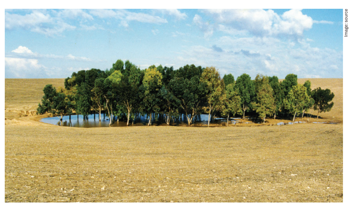
The oases and wadis are home to groves of trees that provide welcome shade to people and animals

from 0.2 to 0.6 ha and is supplied by watersheds 10-100 times as large. They can be used for recreation, fuel or shade.