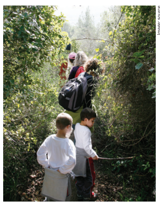
Nature excursions provide opportunities for children to learn about sustainable forest management